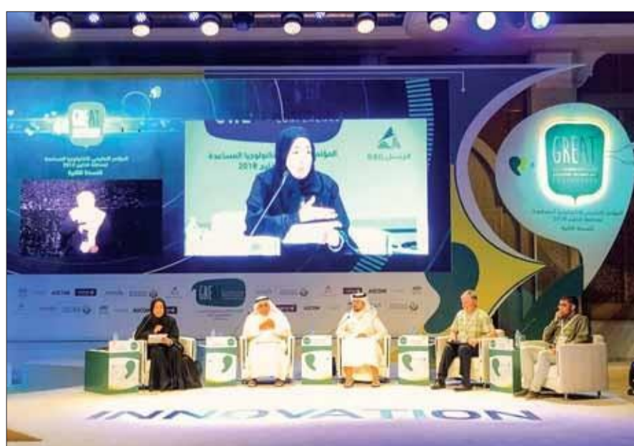
A panel discussion at the event.