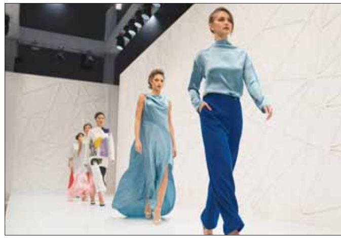
Models showcase a German designer's offerings at the fashion show.

As part of Qatar's 2017 cultural exchange programme – 'Year