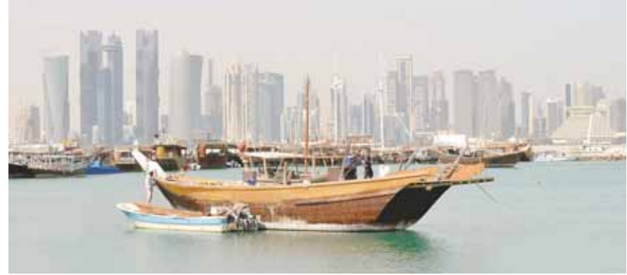
A dhow prepares to sail in Doha.

Built in the heart of the desert 110km northwest of Doha is the Rakayat Fort, dates back to the 19th century. A freshwater well sits in the fort and the scattered remains of a village can be found nearby.