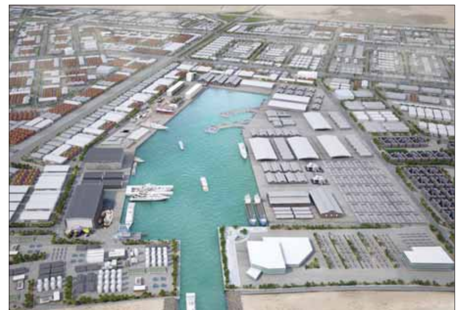
An artistic rendition of a free zone.

Meanwhile, HE the Minister of Economy and Commerce Sheikh Ahmed bin Jas-